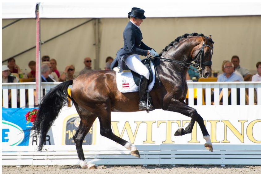
Bartlgut's Duccio by Dimaggio (Dressage)