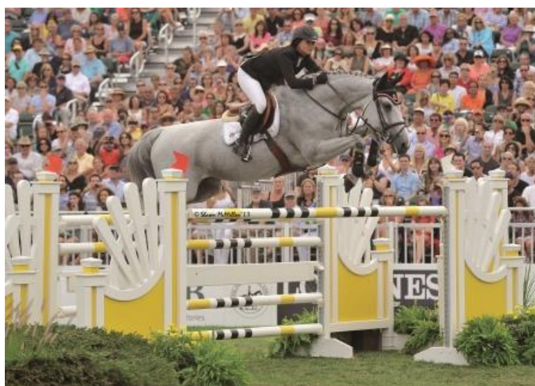
Jovina by Cassini I (Show-Jumping)