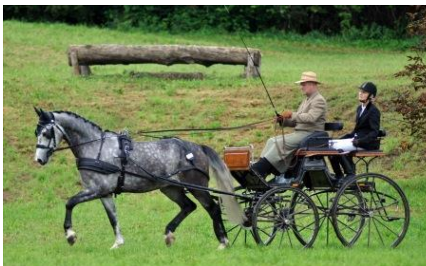
Bambucca by Breitling W (Driving)